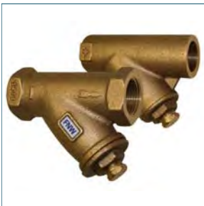
Figure 509 / 510 BRONZE Y-STRAINER • FNPT ENDS (509) & SWEAT ENDS (510) • 509 IS 250 WOG, 150 PSI STEAM • 510 IS 400 WOG, 250 PSI STEAM • CAST BRONZE BODY • 20 MESH STAINLESS STEEL SCREEN • BLOW-OFF PLUG INCLUDED • 509 SIZES 3/8" - 2" • 510 SIZES 1/2" - 2"