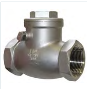
Figure 16B-200 THREADED SS 200 WOG SWING CHECK VALVE • STAINLESS STEEL TRIM • PTFE SEALS • SIZES 1/4" - 2"