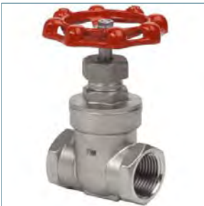
Figure 15B-200 THREADED SS 200 WOG NON-RISING STEM GATE VALVE • STAINLESS STEEL TRIM • ADJUSTABLE PACKING • SIZES 1/2" - 2"