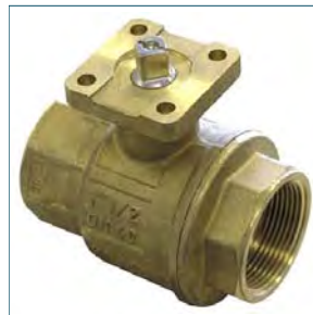
Figure 440 2 PC FULL PORT 600 WOG ISO MOUNT BRASS BALL VALVE • ISO 5211 MOUNTING PAD • RATED 150 WSP • O-RING BACKED SEATS • DOUBLE O-RING VITON® PACKING • FOR DIRECT MOUNT ACTUATION • SIZES 1/4" - 4"