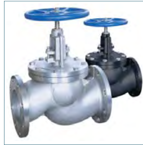
Figure 461 / 462 - SS Figure 561 / 562 - CS FLANGED GLOBE VALVE • 150# FLANGES (461/561) • 300# FLANGES (462/562) • API 600 (CS), API 603 (SS) • INVESTMENT CAST TO 8" (SS ONLY) • MODIFIED PLUG TYPE DISC FOR HAND OPERATED THROTTLING