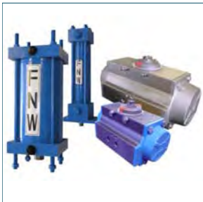
Actuation & Accessories PNEUMATIC ACTUATORS • CYLINDER (PNEUMATIC & HYDRAULIC) • RACK & PINION • SCOTCH YOKE • DOUBLE-ACTING • SPRING-RETURN