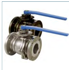
Figure 600 - SSxSS Figure 601 - CSxSS 2 PC FULL PORT 150# FLANGED BALL VALVE • INVESTMENT CAST BODY • ANTI-STATIC DESIGN • RTFE SEATS • ISO MOUNTING PAD • API 6D APPROVED • SIZES 1/2" - 10"