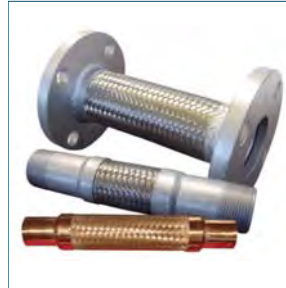
Figure 30F / 30T / 35S BRAIDED METAL ANNULAR FLEXIBLE CONNECTORS • STAINLESS STEEL HOSE IN FLANGED (30F) OR MALE THREADED ENDS (30T) • BRONZE HOSE IN COPPER SWEAT ENDS (35S) • MAXIMUM OFFSET OF 3/8"