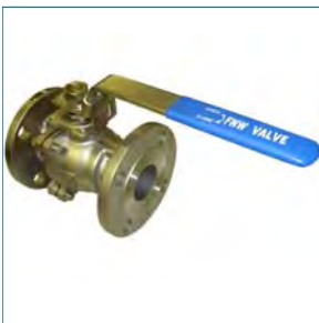
Figure 660 2 PC FULL PORT 150# FLANGED ECONOMY BALL VALVE • INVESTMENT CAST BODY • ANTI-STATIC DESIGN • RTFE SEATS • ISO MOUNTING PAD • SIZES 2" - 6"