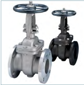
Figure 451 / 452 - SS Figure 551 / 552 - CS FLANGED OS&Y WEDGE GATE VALVE • 150# FLANGES (451/551) • 300# FLANGES (452/552) • API 600 (CS), API 603 (SS) • INVESTMENT CAST TO 8" (SS ONLY) • FLEX WEDGE DESIGN FOR POSITIVE SHUTOFF