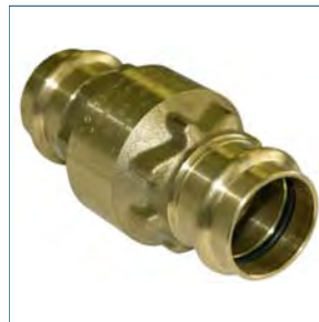
Figure 431 200 PSI PRESS CONNECTION BRASS IN-LINE CHECK VALVE FOR WATER • HIGH CAPACITY DESIGN • LOW 1/2 PSI CRACKING PRESSURE • SOFT SEAT FOR TIGHT SHUTOFF • NSF-61 APPROVED • FORGED BODY & END CAP • SIZES 1/2" - 2"