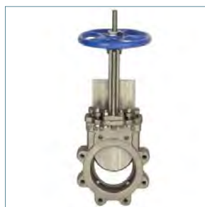
Figure 61B LINED KNIFE GATE VALVE, METAL SEATED