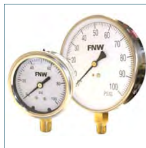
Gauges LIQUID FILLED & MECHANICAL CONTRACTOR'S PRESSURE GAUGES • 2-1/2" LIQUID FILLED (GLYCERIN) • 4-1/2" MECHANICAL CONTRACTOR'S • PRESSURE RANGES FROM 0-30 PSI TO 0-300 PSI