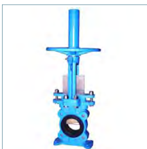
Figure 60R KNIFE GATE VALVE FOR ABRASIVE APPLICATIONS

See our web site for the latest additions to our product offering. We continue to add products that may not be reflected in this brochure. Updates and additional information are also available at: www.FNW.com .