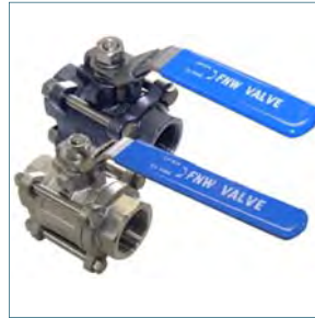
Figure 310 - SSxSS Figure 311 - CSxSS 3 PC FULL PORT 1000 WOG BALL VALVE • INVESTMENT CAST BODY & END CAPS • NPT END (OPTIONAL SOCKET WELD) • SS LOCKING HANDLE • RTFE SEAT • BLOWOUT-PROOF STEM • SIZES 1/4" - 4"