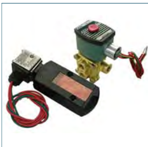
Actuation & Accessories SOLENOID PILOT VALVES • DIRECT (NAMUR) MOUNT OR PIPED CONNECTIONS • VARIOUS NEMA CLASSES • MULTIPLE VOLTAGES AVAILABLE • 3-WAY & 4-WAY CONFIGURATION (OTHERS ON REQUEST) • MANUAL PILOT VALVES IN VARIOUS CONFIGURATIONS ON REQUEST