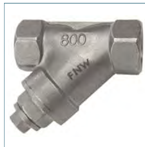
Figure 14B-YSS THREADED SS 800 PSI CWP Y-STRAINER • SS 20 MESH SCREEN • VITON® O-RING SEAL • SIZES 1/2" - 2"