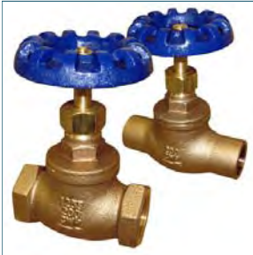
Figure 1231 / 1232 125# BRONZE GLOBE VALVE • 200 WOG • 125 PSI SATURATED STEAM RATED • RESILIENT SEAT DISC • FNPT ENDS (1231) & SWEAT ENDS (1232) • CONFORMS TO MSS SP-80 • 1231 SIZES 1/4" - 3" • 1232 SIZES 1/2" - 2"