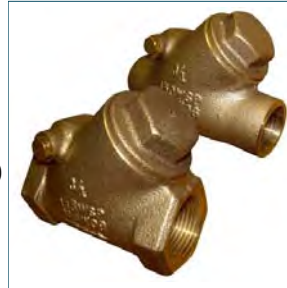
Figure 1241 / 1242 150# Y-PATTERN BRONZE SWING CHECK VALVE • 300 WOG • 150 PSI SATURATED STEAM RATED • RESILIENT SEAT DISC • FNPT ENDS (1241) & SWEAT ENDS (1242) • CONFORMS TO MSS SP-80 • SIZES 1/2" - 3"