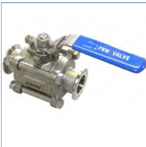
Figure 330CE SANITARY 3 PC FULL PORT 1000 WOG SS BALL VALVE • CLAMP ENDS (OPTIONAL TUBE ENDS) • CAVITY FILLED SEATS • SILICON FREE CONSTRUCTION • SS LOCKING HANDLE • PTFE SEATS • SIZES 1/2" - 4"