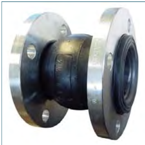
Figure 40 SINGLE SPHERE FLEXIBLE CONNECTOR • 150# CARBON STEEL FLOATING FLANGES • WIRE AND FABRIC REINFORCEMENT MOLDED INTO ELASTOMER SPHERE • SIZES 2-1/2" - 10"