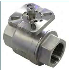
Figure 220M 2 PC FULL PORT 2000 WOG ISO MOUNT SS BALL VALVE • ISO 5211 MOUNTING PAD • LIVE LOADED PACKING • INVESTMENT CAST BODY & END CAP • RTFE SEATS • FOR DIRECT MOUNT ACTUATION • SIZES 1/4" - 3"