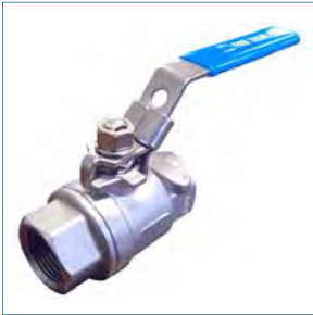
Figure 260 2 PC ECONOMY 1000 WOG STAINLESS STEEL BALL VALVE • FULL PORT • INVESTMENT CAST BODY & END CAP • RTFE SEATS • SS LOCKING HANDLE • BLOWOUT-PROOF STEM • SIZES 1/4" - 2"