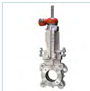
Figure 2000BTIV TRANSMITTER ISOLATION VALVE