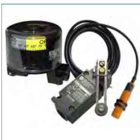
Actuation & Accessories POSITION / LIMIT SWITCHES • VARIOUS CONFIGURATIONS AND ENCLOSURE RATINGS AVAILABLE • QUARTER-TURN SELF CONTAINED • MECHANICAL • PROXIMITY