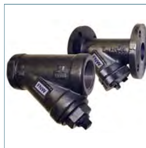
Figure 558 / 559 CAST IRON Y-STRAINER • 125# FLANGED ENDS (558) & FNPT ENDS (510) • 558 IS 200 WOG, 125 PSI STEAM • 559 IS 400 WOG, 250 PSI STEAM • STAINLESS STEEL SCREEN • BLOW-OFF PLUG INCLUDED • 558 SIZES 2" - 12" • 559 SIZES 1/4" - 3"