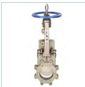
Figure 2000B HIGH PERFORMANCE KNIFE GATE VALVE