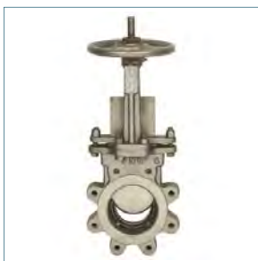
Figure 62B LINED KNIFE GATE VALVE, RESILIENT SEATED