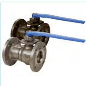
Figure 500 - SSxSS Figure 501 - CSxSS 1 PC STANDARD PORT 150# FLANGED BALL VALVE • INVESTMENT CAST BODY • ANTI-STATIC DESIGN • RTFE SEATS • ISO MOUNTING PAD • API 6D APPROVED • SIZES 2" - 6"