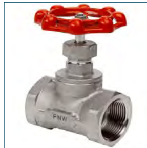
Figure 17B-200 THREADED SS 200 WOG GLOBE VALVE • STAINLESS STEEL TRIM • ADJUSTABLE PACKING • SIZES 1/2" - 2"