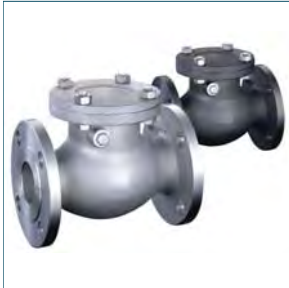
Figure 471 / 472 - SS Figure 571 / 572 - CS FLANGED SWING CHECK VALVE • 150# FLANGES (471/571) • 300# FLANGES (472/572) • API 600 (CS), API 603 (SS) • MACHINED DISC & SEAT FOR TIGHT SHUTOFF