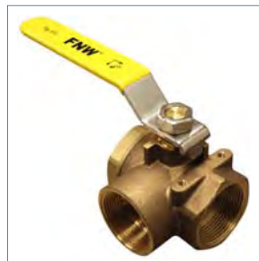
Figure 413 3-WAY DIVERTER 400 WOG BRASS BALL VALVE • NPT END CONNECTIONS • L-PORT CONFIGURATION • RATED 150 WSP • RTFE SEATS • BLOWOUT-PROOF STEM • ACTUATOR MOUNTING PAD • SIZES 1/4" - 2"