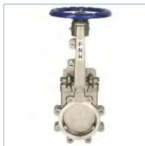
Figure 65B CAST SS KNIFE GATE VALVE, METAL SEATED