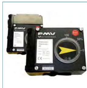
Actuation & Accessories VALVE POSITIONERS • 3-15 PSI SIGNAL (PNEUMATIC) • 4-20mA SIGNAL (ELECTRO-PNEUMATIC) • VARIOUS CONFIGURATIONS AND ENCLOSURE RATINGS AVAILABLE • DIGITAL, SMART, HART® & OTHERS ON REQUEST