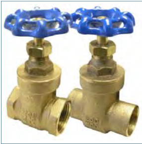
Figure 1211 / 1212 NON-RISING STEM 125# BRONZE GATE VALVE • 200 WOG • 125 PSI SATURATED STEAM RATED • SOLID WEDGE DISC • FNPT ENDS (1211) & SWEAT ENDS (1212) • BACK SEAT DESIGN • CONFORMS TO MSS SP-80 • 1211 SIZES 1/4" - 3" • 1212 SIZES 1/2" - 3"