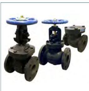
Figure 651 / 661 / 671 125# IRON BODY, BRONZE MOUNTED VALVE • IBBM GATE (651), GLOBE (661), & CHECK (671) VALVES • 125 PSI SWP (SATURATED TO 353°F) • DESIGN AND TESTED TO: • GATES: MSS SP-70 • GLOBES: MSS SP-85 • CHECKS: MSS SP-71