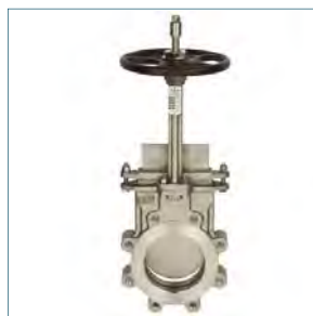
Figure 68B CAST SS KNIFE GATE VALVE, RESILIENT SEAT