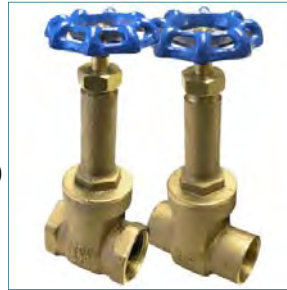
Figure 1221 / 1222 RISING STEM 125# BRONZE GATE VALVE • 200 WOG • 125 PSI SATURATED STEAM RATED • SOLID WEDGE DISC • FNPT ENDS (1221) & SWEAT ENDS (1222) • BACK SEAT DESIGN • CONFORMS TO MSS SP-80 • SIZES 1/2" - 3"