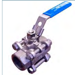
Figure 360 3 PC ECONOMY 1000 WOG STAINLESS STEEL BALL VALVE • FULL PORT • INVESTMENT CAST BODY & END CAPS • NPT END (OPTIONAL SOCKET WELD) • SS LOCKING HANDLE • RTFE SEATS • SIZES 1/4" - 4"