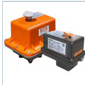
Actuation & Accessories ELECTRIC VALVE ACTUATORS • QUARTER-TURN DESIGN • VARIOUS NEMA CLASSES • MULTIPLE VOLTAGES AVAILABLE • DOUBLE-ACTING (STAY IN LAST POSITION) & SPRING-RETURN DESIGNS • MULTI-TURN & LARGE BODY ELECTRIC ACTUATORS AVAILABEL ON REQUEST