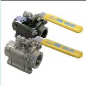
Figure 320 / 320C - SSxSS Figure 321 / 321C - CSxSS 3 PC FULL PORT 2000 WOG BALL VALVE • INVESTMENT CAST BODY & END CAPS • NPT END (OPTIONAL SOCKET WELD) • SS LOCKING HANDLE • RTFE SEATS (150 WSP RATED w/ OPTIONAL CARBON FILLED SEATS) • SIZES 1/4" - 2"