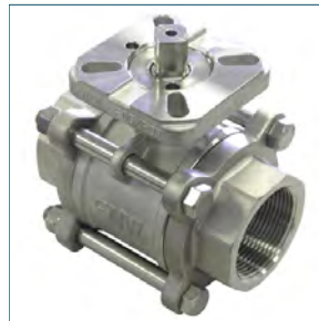
Figure 310M 3 PC FULL PORT 1000 WOG ISO MOUNT SS BALL VALVE • ISO 5211 MOUNTING PAD • LIVE LOADED PACKING • INVESTMENT CAST BODY & END CAPS • NPT ENDS (OPTIONAL SOCKET WELD) • RTFE SEATS • FOR DIRECT MOUNT ACTUATION • SIZES 1/4" - 4"