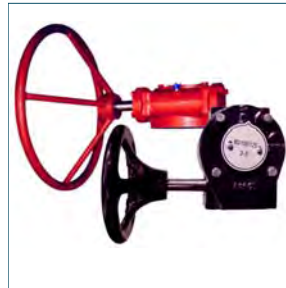
Actuation & Accessories MANUAL GEAR OPERATORS • WORM GEARS FOR QUARTER-TURN • BEVEL GEARS FOR LINEAR MOVEMENT • VARIOUS SIZES • AVAILABLE WITH ISO 5211 MOUNTING FOR DIRECT MOUNT VALVES • MACHINED MOUNTING ADAPTION ALSO AVAILABLE