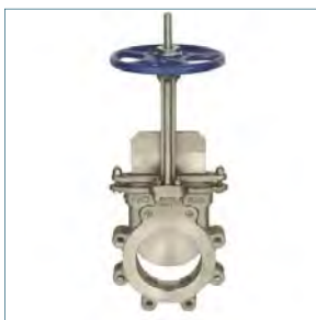
Figure 67B CAST SS KNIFE GATE VALVE, METAL SEATED